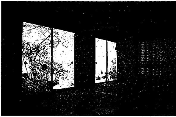
(Fig. 3) Flowering Plants of the Four Seasons: Spring and Autumn By Kosemura Mami (b. 1975), 2004 Animation, colour and sound Duration 9 minutes (endless repeat) At the Shibazaki residence, Kawaguchi, Saitama prefecture, Japan

work can be far more flexible, and can extend beyond a conventional 'black box' theatre.